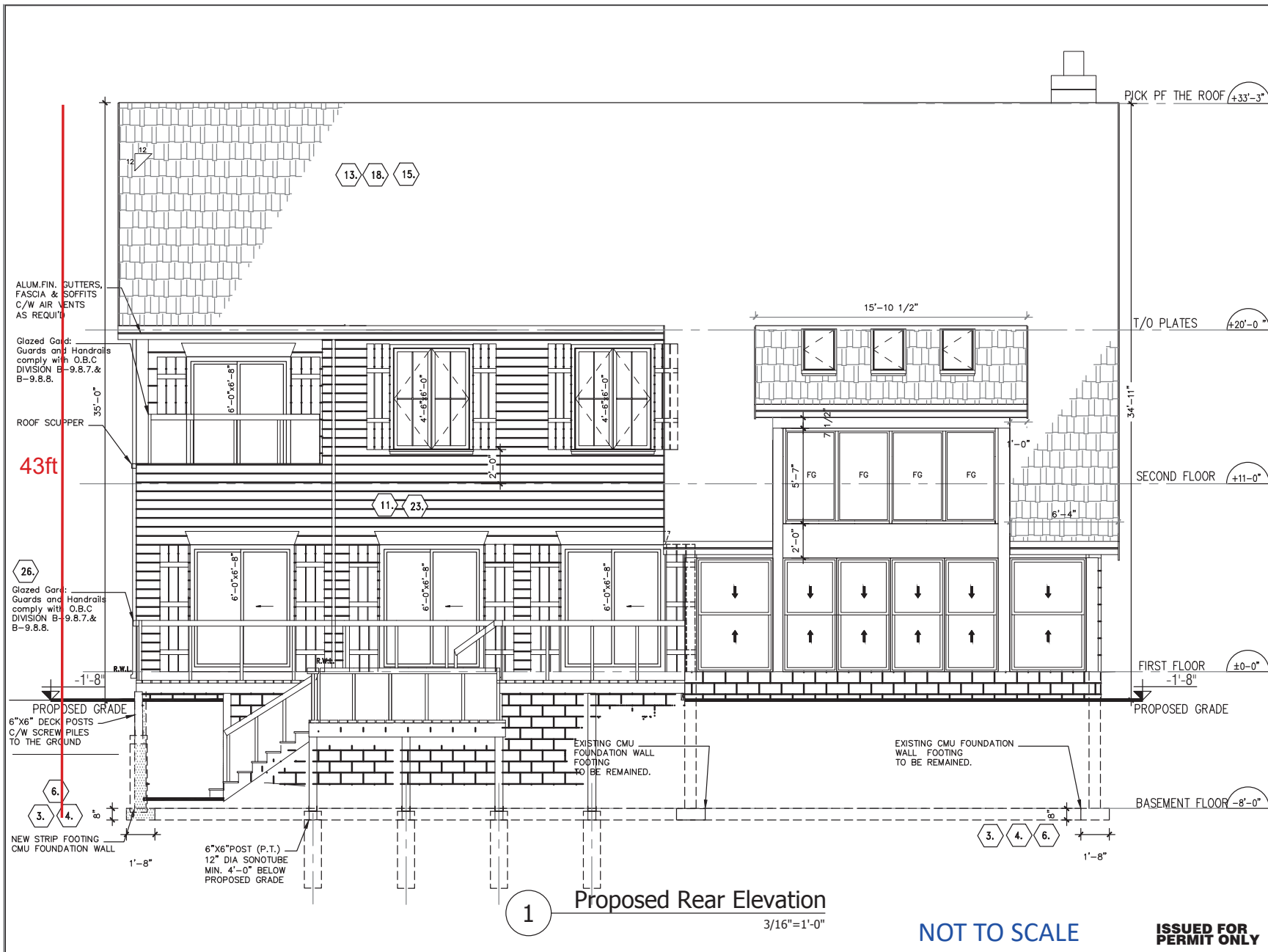
1 Proposed Rear Elevation 3/16"=1'-0"